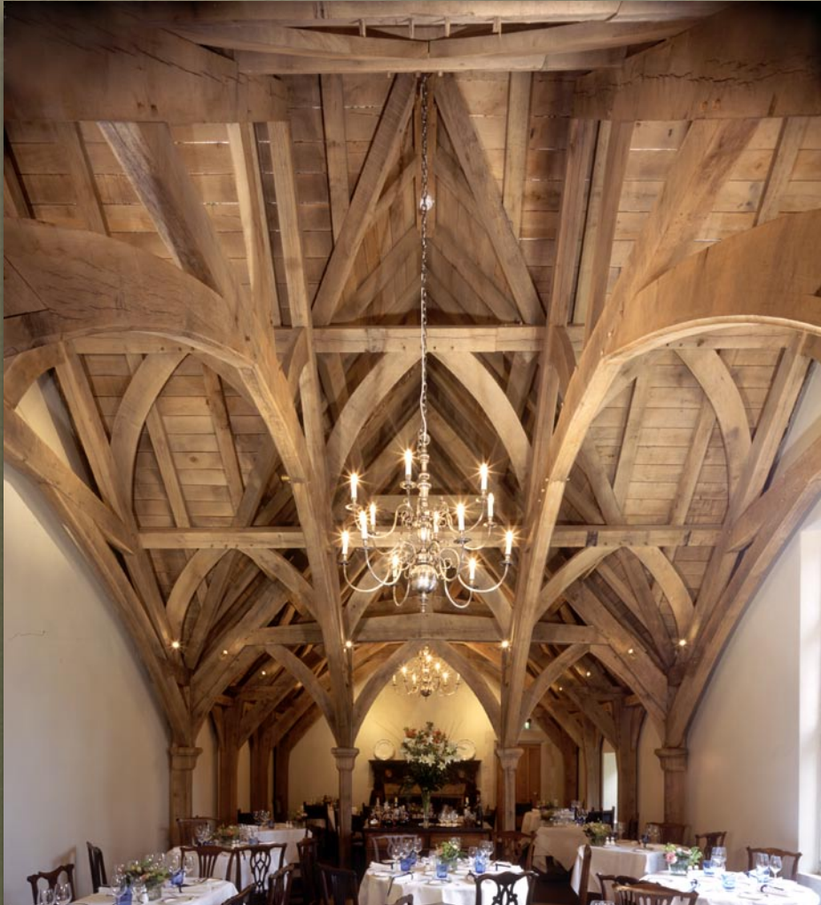
"Great Fosters Dining Hall"