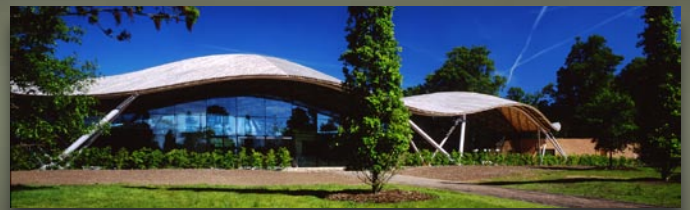
'Savill Gardens' Visitors Centre