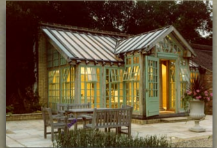
"Old Farnham Park House"