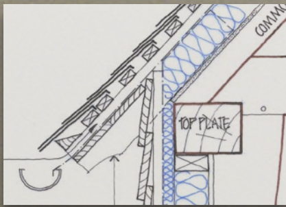
Detailed construction drawings

We have examples of our work locally that you may wish to come and see to get the creative process under way. Visitors are welcome by appointment at our office and workshop near Petersfield.