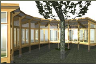
Computer Model of 'Radial Retreats'