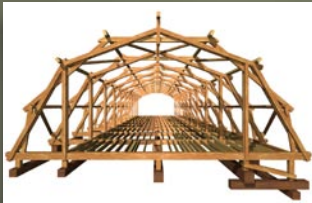
Computer Model of 'Minstead Rural Study Centre'

Whilst our expertise springs from the long history of well established carpentry skills and green oak framing, we do not feel bound by tradition and have built on this knowledge to expand these principles to modern structures. We have played a key role in the design, engineering and construction of many exciting, contemporary and special projects that place timber framing firmly in the 21st century.