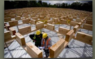
New Construction Methods