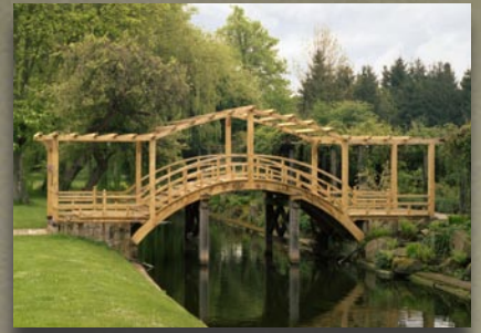
"Great Fosters Bridge"