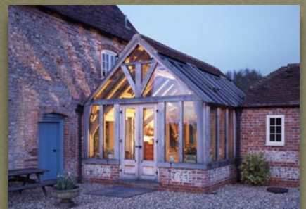
"Westcourt Farm Conservatory"