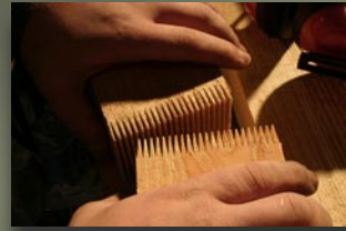
Modern Carpentry Techniques