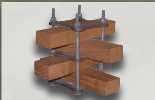
'Node Clamp' from the 'Downland Gridshell'