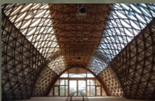
Interior View of the 'Downland Gridshell'