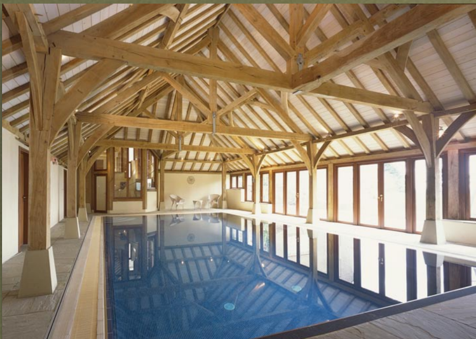
"Marley Manor Pool Barn"