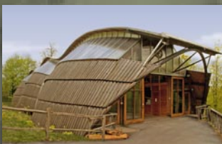
Exterior View of the 'Downland Gridshell'