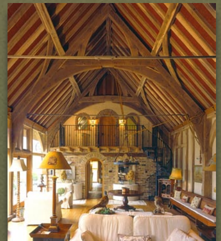
"Little Manor Barn"