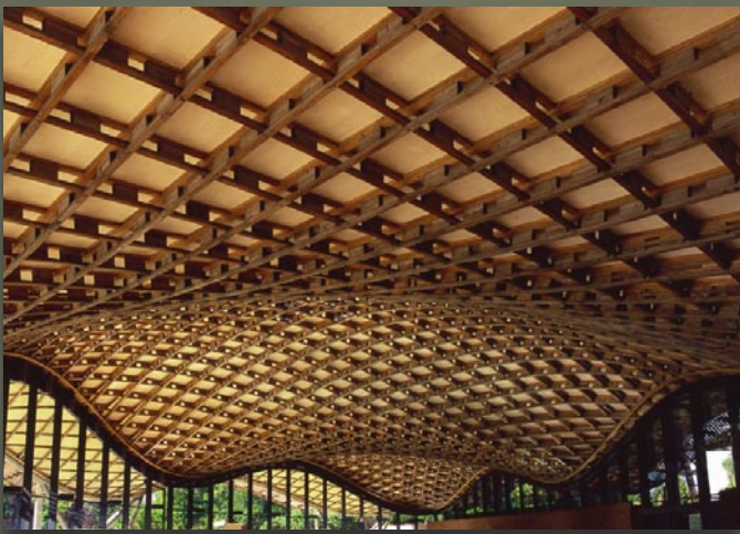
'Savill Gardens' Visitors Centre