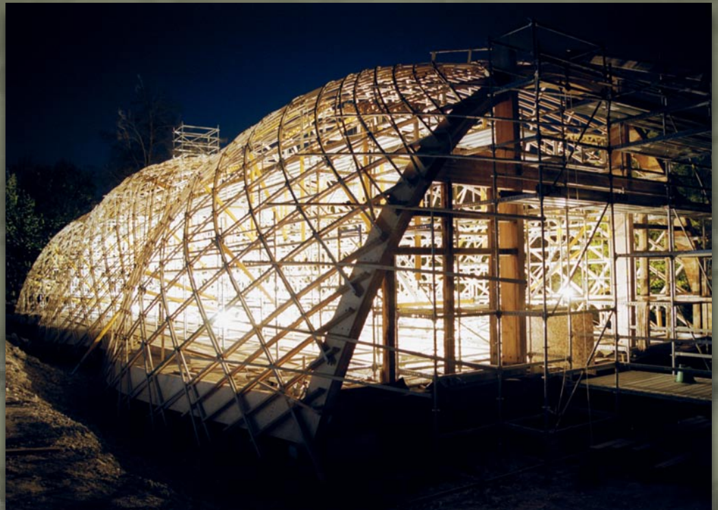
'Downland Gridshell' at the Weald and Downland Open Air Museum (During Construction)