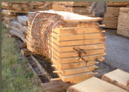
Curved Stock for Braces