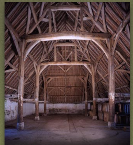
"Berry Court Barn" (Grade 1 Listed Building)